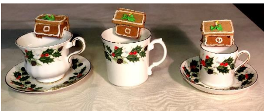
Also this year we have baked small gingerbread houses to put on a cup or hung on the Christmas tree.