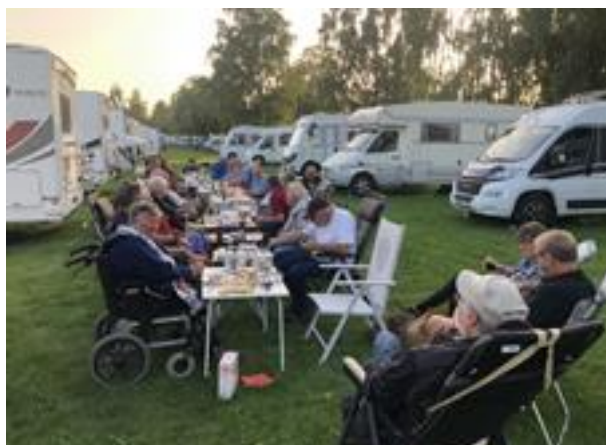
As usual in September, we participated in the Elmia fair in the company of Nordic Motorhome Club members.