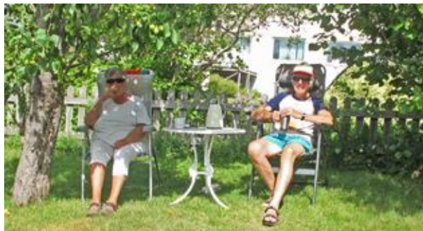
We like to have afternoon coffee under the apple tree.